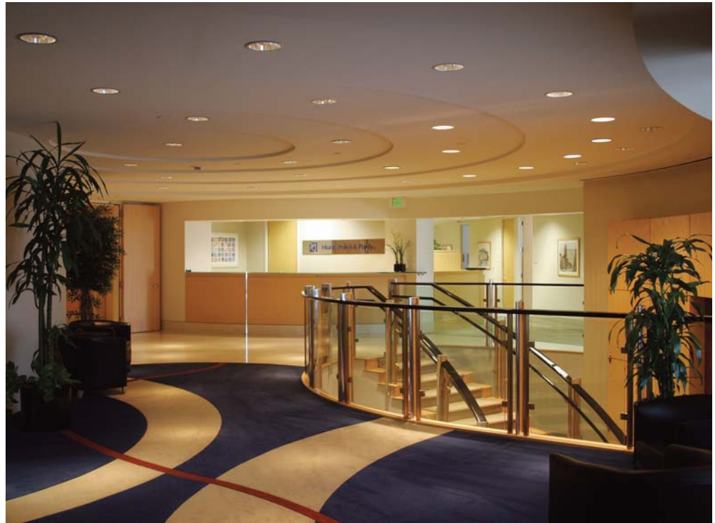
Our Award-Winning Los Angeles Lobby

3883 Howard Hughes Parkway Suite 560 Las Vegas, NV 89169 T: 702.862.8300 F: 702.862.8400